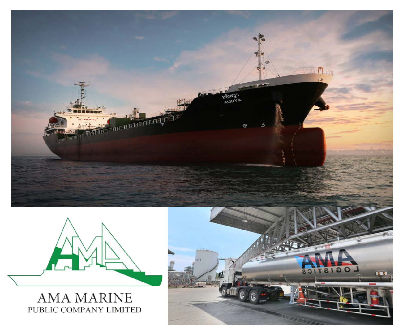
On 18 April 2017 at 14.00 hrs.,

At Universe 1 Room, 12<sup>th</sup> Floor, Space by Miracle Convention Center,